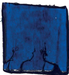
BLU + VIOA + VERDE ACQUA (↑)